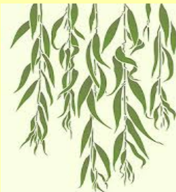
Weeping Willow tree leaf